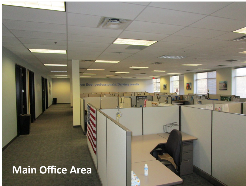
Main Office Area