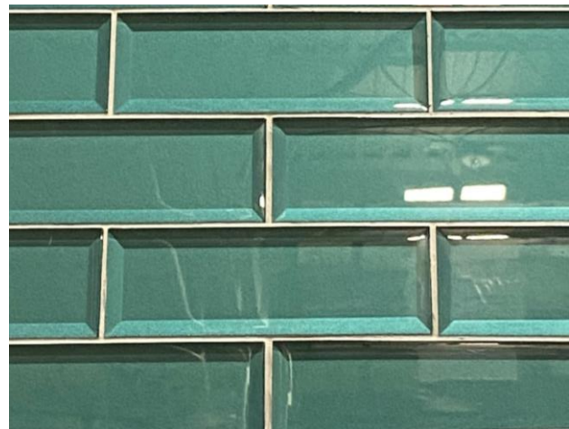
DISPLAY COUNTER ACCENT