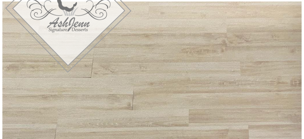
MAIN DINING FLOORING