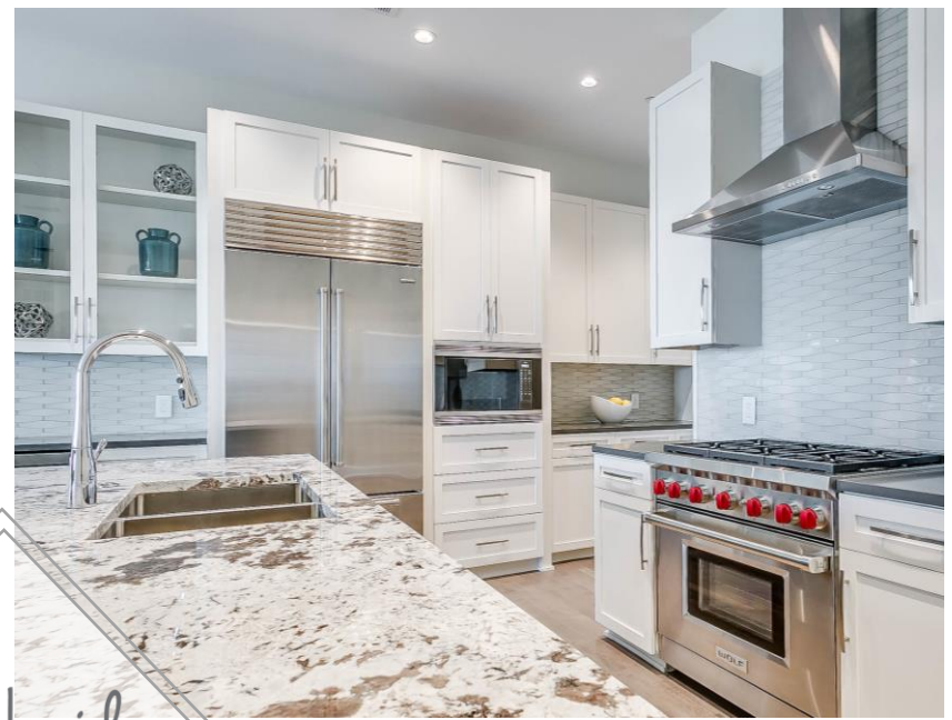
The Lakeside Tower